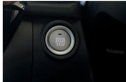
SMART KEYLESS ENTRY AND A PUSH START BUTTON.