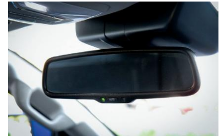
AUTO-DIMMING MIRROR & DASHCAM POWER OUTLET.