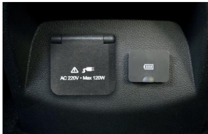
220V POWER OUTLET.

The ACC automatically adjusts the vehicle speed to maintain a safe following distance.